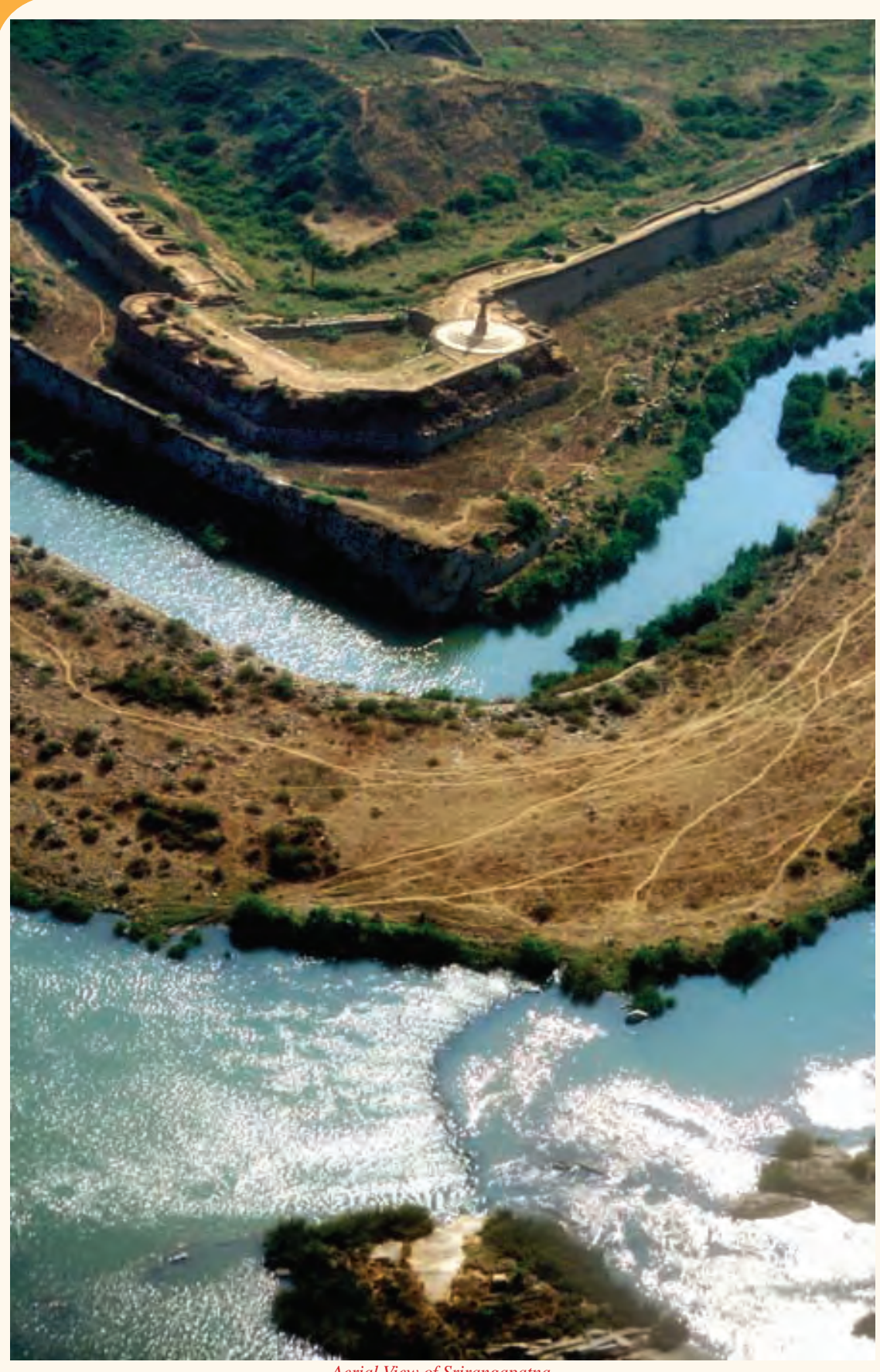
Aerial View of Srirangapatna