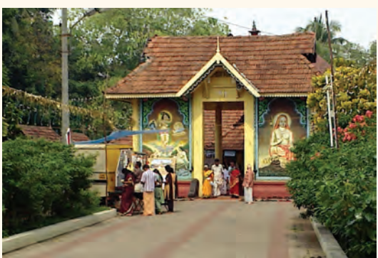
Shringeri Matha, Shringeri

The Shringeri Matha had also a Jagir , administered by the Matha, with a cluster of villages under its administrative control. The grants had been made